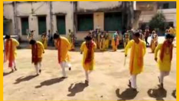
Basanta Utsab Celebration