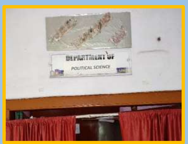
Some Departments of College