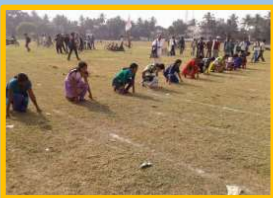
Some Pictures of Annual Sports