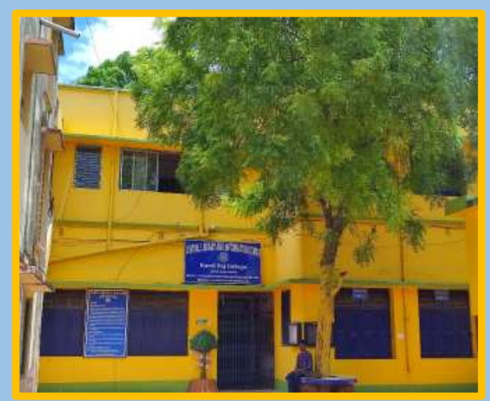
Administrative part of College and Central Library